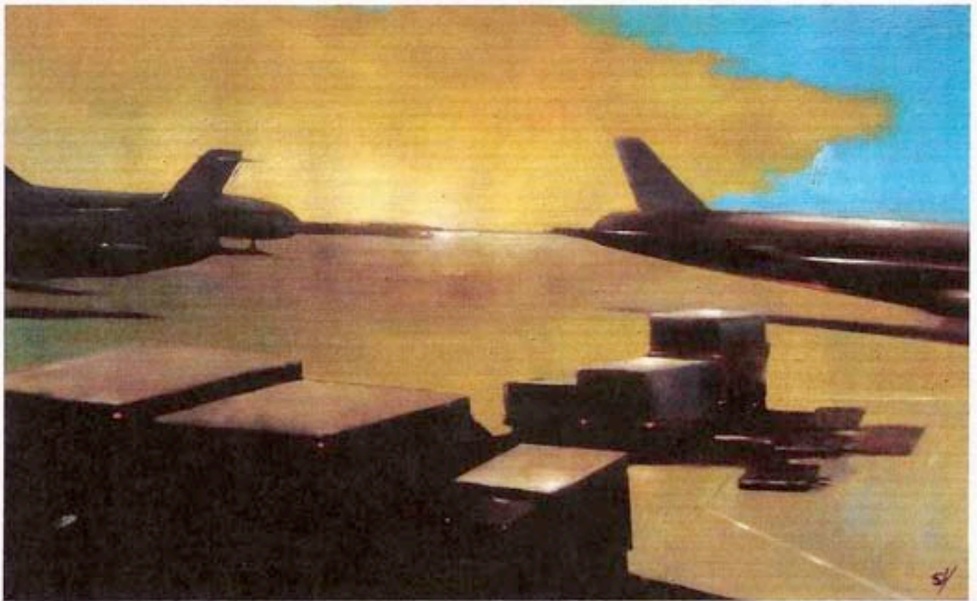
SCOTT YESKEL, TARMAC, OIL ON WOOD PANEL, 36 X 58"