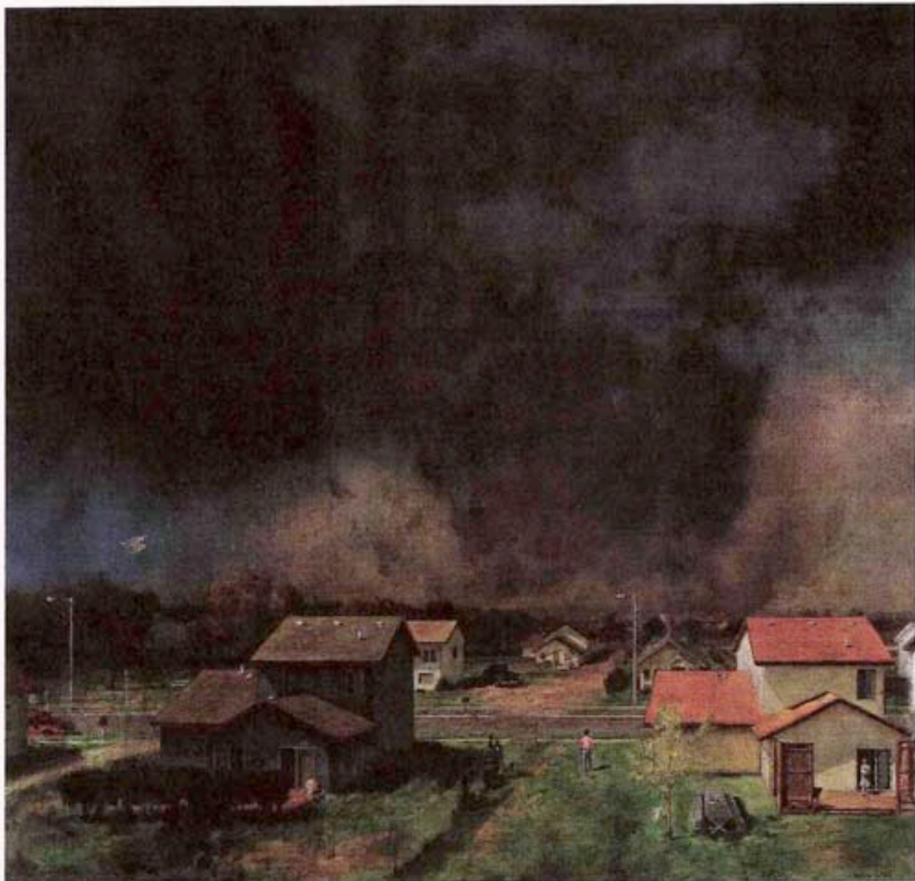
JOHN BROSIO, BACKYARD PHILOSOPHY, OIL ON CANVAS, 36 X 36"

me moving back toward this notion of allegory, a little bit at least, and away from the more abstract and picturesque usage of funnel clouds and twisters."