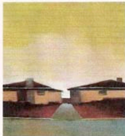
SCOTT YESKEL, FONTANA, OIL ON WOOD PANEL, 24 X 24"

"The show is entitled Disconnections . The images talk about a quiet disconnection in the work," says Yeskel. "There is a